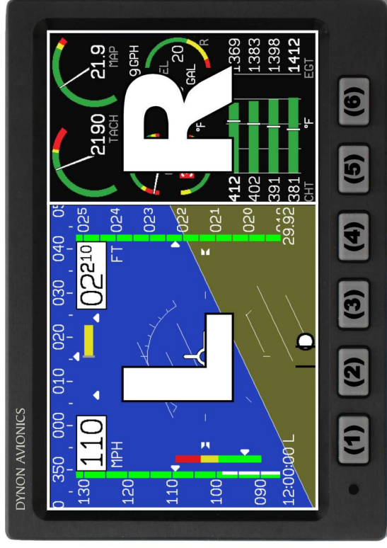
◀ Previous Screen in Rotation (1)